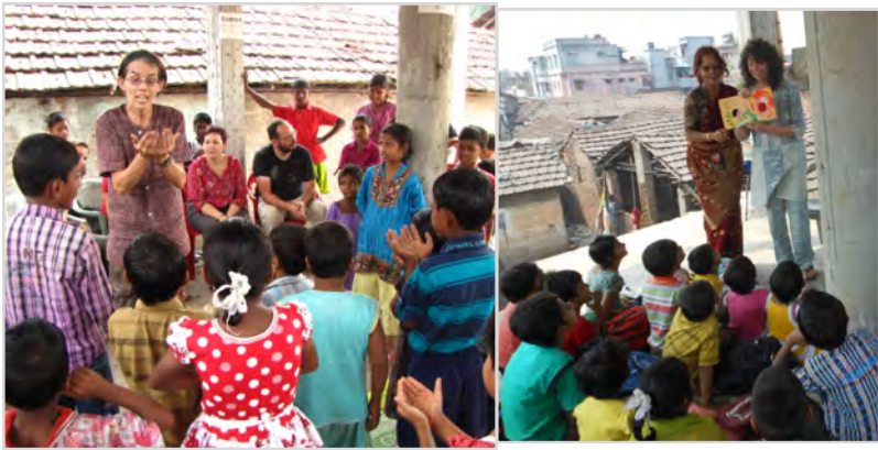
High above the rooftops, kids sat on concrete slabs....their only classroom for months.