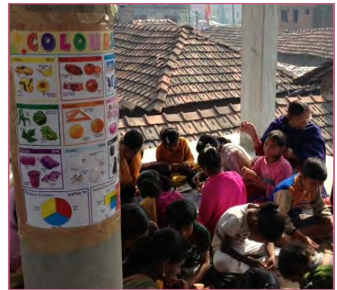
Rooftop Teaching—A Memorable Experience