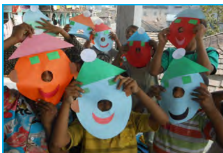
A fun way to learn shapes and colors