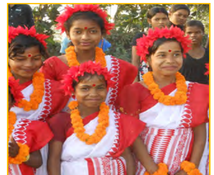
Dancers at Khamargachi School